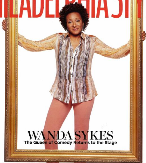
WANDA SYKES The Queen of Comedy Returns to the Stage

BEST OF STYLE 2012: What's Hot in Philadelphia